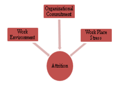
Figure 1: Organizational Factors and Attrition